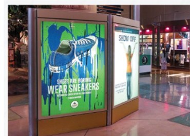
Shopping Mall Advertising Signs