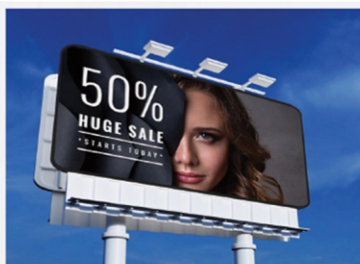
Light Box Poster