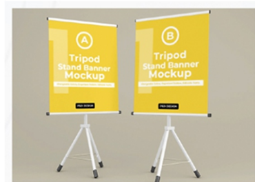
Background Wall Cloth