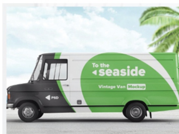
Customized Car Stickers